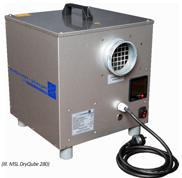
(III. MSL DryQube 280)